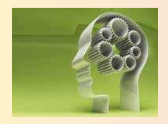
Technology Division National Science Foundation 47/5, Maitland Place Colombo 07

Tele: 0112676766, 0112694163 E-mail: td@nsf.ac.lk Website: www.nsf.ac.lk